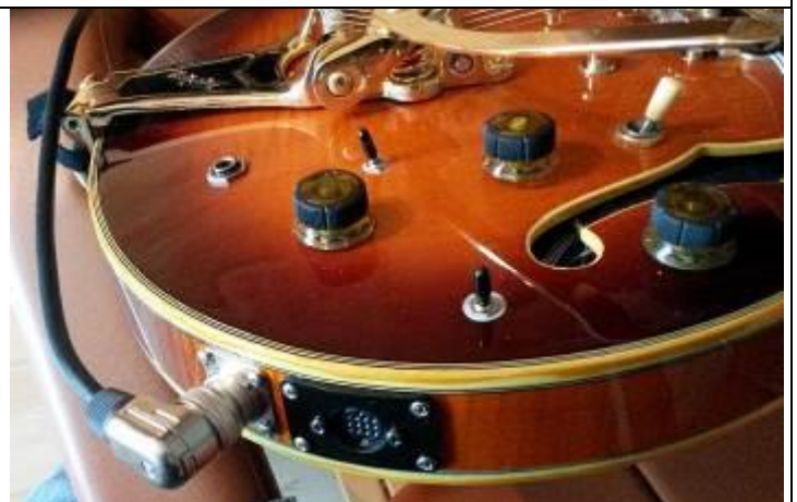
Added 14p-binder connector to the GK-System on my Ibanez AS200. I prefer to use a tilted male plug!